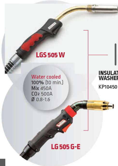
LGS 505 W

Water cooled 100% (10 min.) Mix 450A CO 2 500A Ø 0.8-1.6