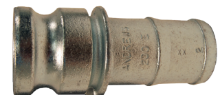
plated malleable iron