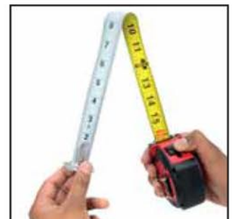
Double sided marked blade