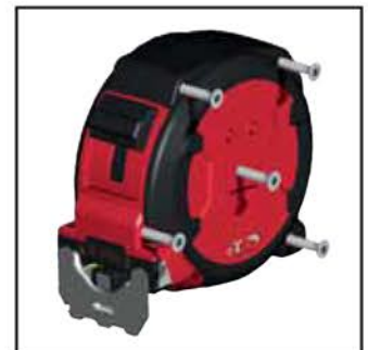
Reinforced housing with 5 screws