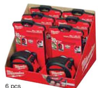
6 pcs master carton

Orders are only possible in master cartons (contains 6x 48225305). Minimum order quantity is 6x 48225305 (= 1 master carton). Order quantities greater than 6 pcs are to be ordered in multiples of 6 pcs (i.e. 12, 18, 24, 30...).