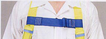
45mm Steel Buckle

All the above harness models can be supplied with any of the following chest straps.