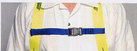
25 mm Plastic Buckle