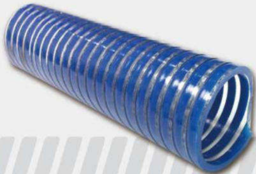
Flexible PVC Tube